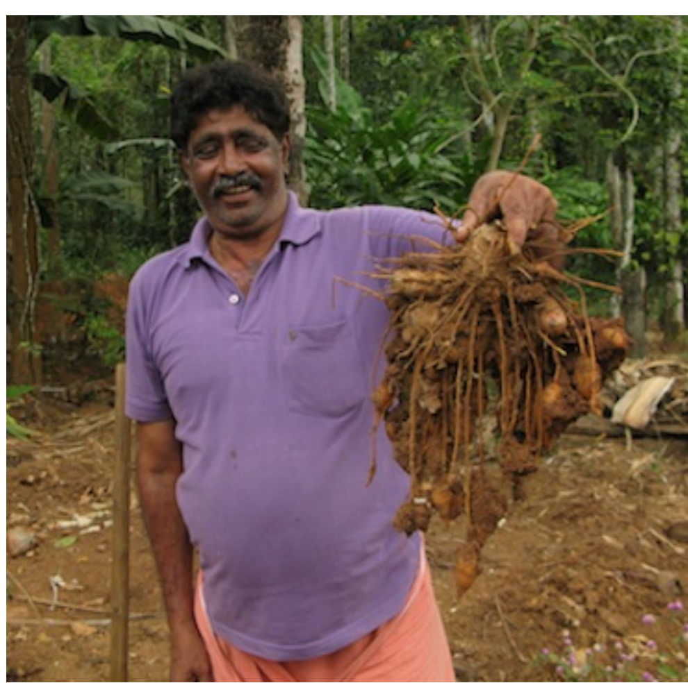
Farmer harvesting turmeric

Become part of this new model for trade and order your farm box from Kerala now on WeMakelt and spread the word about our crowdfunding campaign.